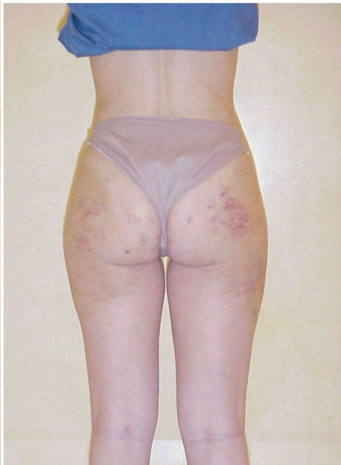
AFTER 7 DAYS